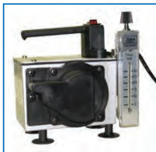
Air Testing Pump and Cassette

Air samples can tell you if you have hidden moisture or leaks that are producing spores that may represent a health risk to you and your family.